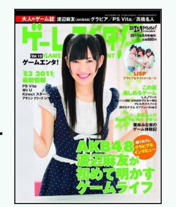
Previous GAME ENTETAINMENT!